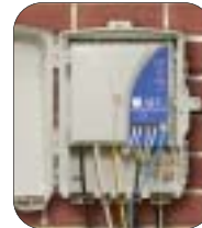
Your ONT box when opened.

Optical Network Terminal or ONT. That way, it can be "read" by your telephone and computer. Information that is sent from your house will be converted from the electric signals to light in the ONT.